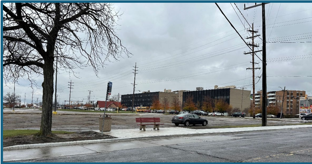
Intersection of Southgate Park Boulevard and Northfield Road

The City of Maple Heights recently completed the construction of concrete sidewalk and a bus pad at the intersection of Southgate Park Boulevard and Northfield Road under the 2024 Pavement Repair Program. GCRTA has committed to the installation of a bus shelter at this location in the near future.