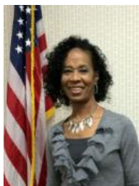
Tanglyn Madden Ward 5 Councilwoman