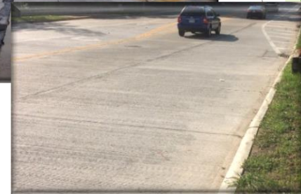
ABOVE - Lee Road - Before & After