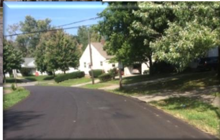
ABOVE - Auburn Road - Before & After