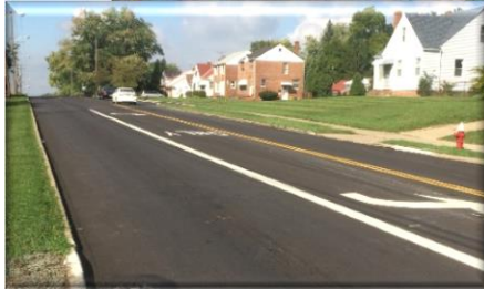
ABOVE - Libby Road - Before & After