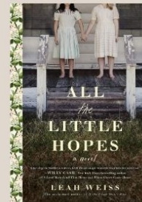
July 26, 2023

WEDNESDAY, JULY 26, 2023 ALL THE LITTLE HOPES BY LEAH WEISS