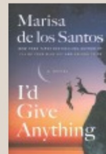
August 24, 2022