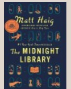
September 28, 2022