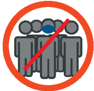
Avoid Large Groups