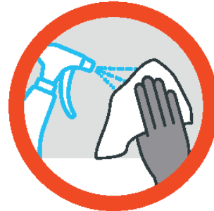
Clean and Disinfect