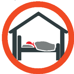
Stay Home When Sick