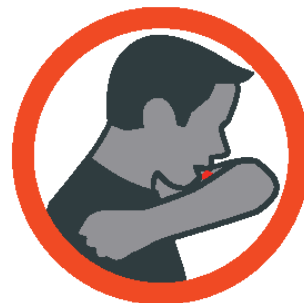
Cough or Sneeze into Your Elbow