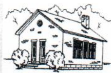
LITTLE RED SCHOOLHOUSE