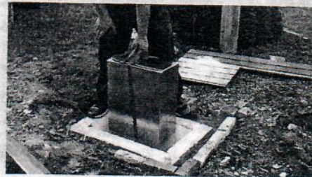
2016 Time Capsule Burial

In addition to our special events, the Museum is now open every Monday and Wednesday evening from 7 pm – 9 pm and by appointment anytime. Thanks to all our members that continue to support our mission of preserving Maple Heights History. We hope to see you all this summer.