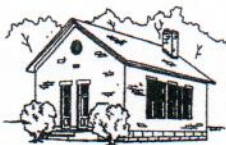
LITTLE RED SCHOOLHOUSE