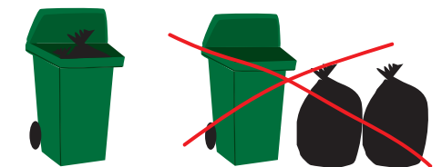
Cart must be filled before extra cans or bags are placed outside the cart.